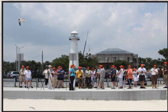
MCAS serves Jackson, Harrison, Hancock, George, Stone, and Pearl River Counties.

We offer a great opportunity for individuals to get involved in their community, meet people committed to conservation, learn more about their local environment, enjoy a birding trip, or volunteer to help make a difference. Join us today!